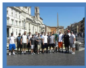
SCIAC All Stars

*The above itinerary is a provisional/suggested itinerary and can/will change depending on your group's specific wishes, the final game schedule for your team(s) and any pro game visit(s) incorporated for your group. Sightseeing admission fees are not included in the prices but can be added and pre-booked based on your group's specific wishes. Consult us for more information.