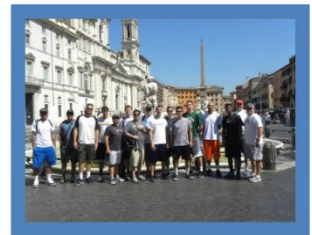
SCIAC All Stars

The Roman Forum: The Roman Forum is a rectangular forum (plaza) surrounded by the ruins of several important ancient government buildings at the center of the city of Rome. Citizens of the ancient city referred to this space, originally a marketplace, as the Forum Magnum, or simply the Forum. Located in the small valley between the Palatine and Capitoline Hills, the Forum today is a sprawling ruin of architectural fragments and intermittent archaeological excavations attracting 4.5 million sightseers each year.