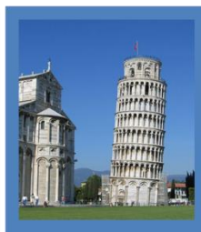
Leaning Tower of Pisa