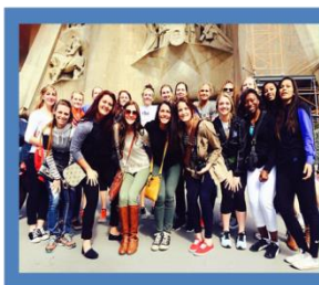
University of Mary