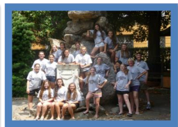
Lake Hill Storm SC