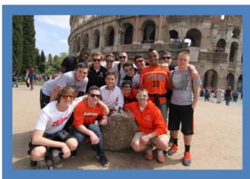
Wartburg College Men's Soccer