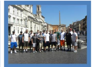
SCIAC All Stars

*The above itinerary is a provisional/suggested itinerary and can/will change depending on your group's specific wishes, the final game schedule for your team(s) and any pro game visit(s) incorporated for your group. Sightseeing admission fees are not included in the prices but can be added and pre-booked based on your group's specific wishes. Consult us for more information.