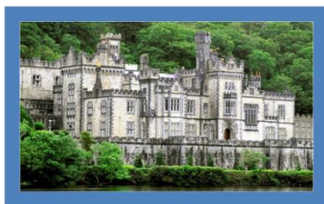
Galway Kylemore Abbey