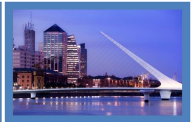
Buenos Aires Bridge