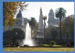
Plaza de Mayo