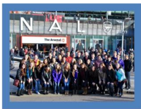
Arsenal Game Albion College

HAMPTON COURT PALACE: Hampton Court Palace is a royal palace in the London Borough of Richmond upon Thames, Greater London, in the historic county of Middlesex; it has not been inhabited by the British Royal Family since the 18th century.