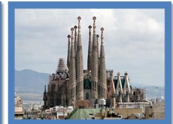
La Sagrada Familia