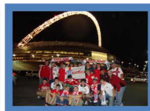
Glenn Falls High School