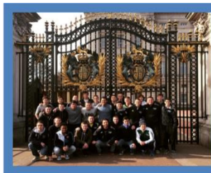
Wisconsin Lutheran College