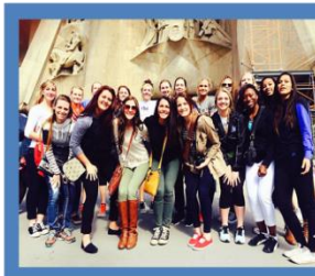
University of Mary