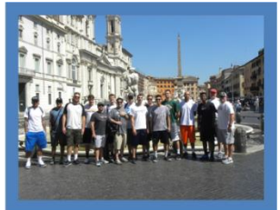
SCIAC All Stars

*The above itinerary is a provisional/suggested itinerary and can/will change depending on your group's specific wishes, the final game schedule for your team(s) and any pro game visit(s) incorporated for your group. Sightseeing admission fees are not included in the prices but can be added and pre-booked based on your group's specific wishes. Consult us for more information.