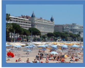
Beach in Cannes