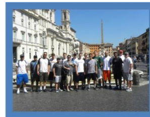
SCIAC All Stars

*The above itinerary is a provisional/suggested itinerary and can/will change depending on your group's specific wishes, the final game schedule for your team(s) and any pro game visit(s) incorporated for your group. Sightseeing admission fees are not included in the prices but can be added and pre-booked based on your group's specific wishes. Consult us for more information.